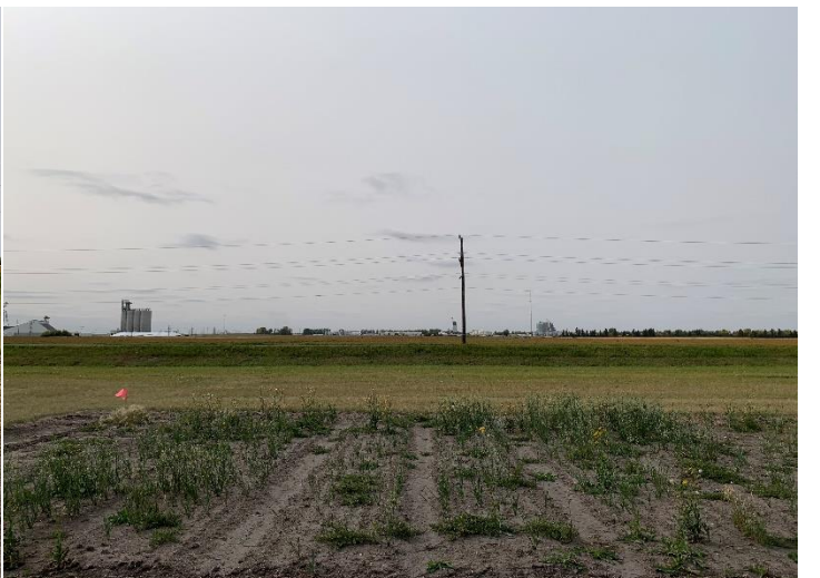
Pictures 24 and 25. Replication 3 (very high salinity-sodicity) barley (left) plots with no-growth and oat (right) plots with sporadic growth not quite ready to be harvested on September 15, 2020.