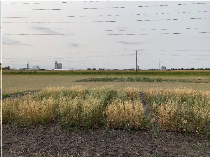
Pictures 22 and 23. Replication 2 (moderate to high salinity-sodicity) barley (left) and oat (right) plots not quite ready to be harvested on September 15, 2020.