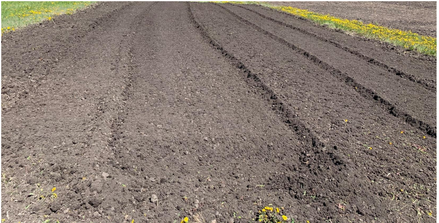
Picture 1. Replication 1 (low to moderate salinity-sodicity) with nice seedbed on June 1, 2020.

Seedbed was very mellow in replication 1 (low to moderate salinity-sodicity), whereas, it started getting hard and cloddy with the increase in sodicity in replication 2 (moderate to high salinity-sodicity) and 3 (very high salinity-sodicity). See Pictures 1, 2 and 3 for comparisons.