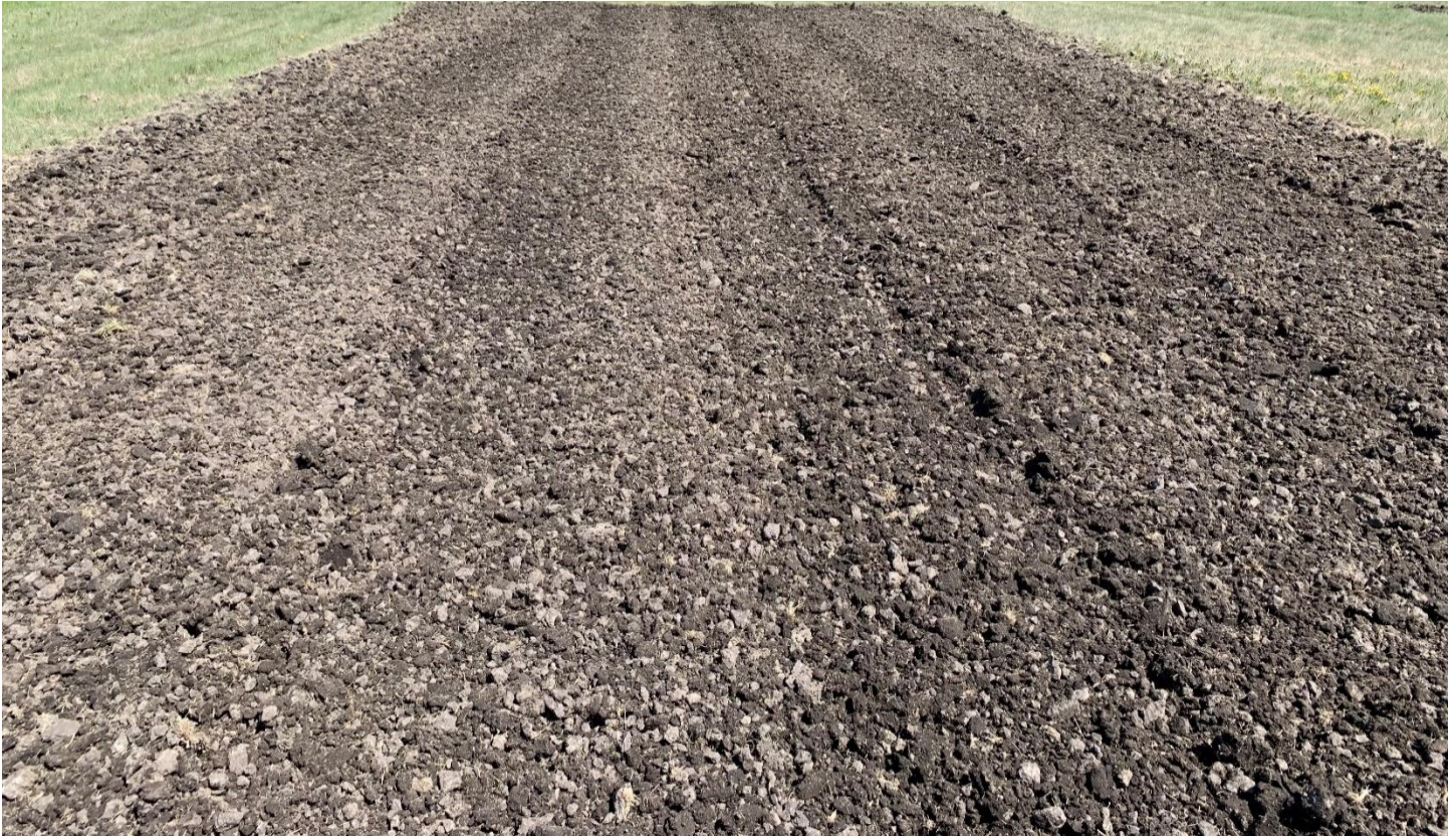
Picture 3. Replication 3 (very high salinity-sodicity) with hard and cloddy seedbed on June 1, 2020.

Seed germination started in replication 1 (low to moderate salinity-sodicity) around seven days after planting (June 8 th ) and completed in about eleven days (June 11 th ). In replication 2 (moderate to high salinity-sodicity), germination started around June 16 th and completed around June 23 rd . So, replication 2 germination was eight to twelve days delayed compared to replication 1. In replication 3 (very high salinity and sodicity) all four barley varieties had zero germination, whereas, some oat seeds started germinating around June 29 th . See Pictures 4 to 9 for comparisons.