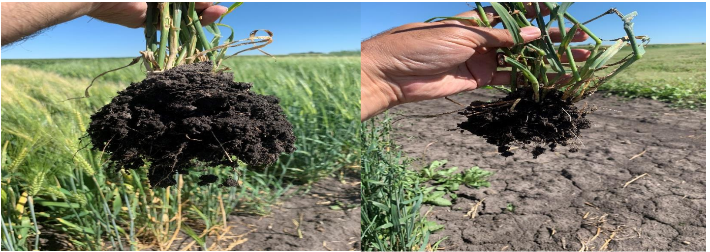
Picture 16 and 17. Barley (left) and oats (right) rooting depths in replication 1 (low to moderate salinity-sodicity) on August 10, 2020.