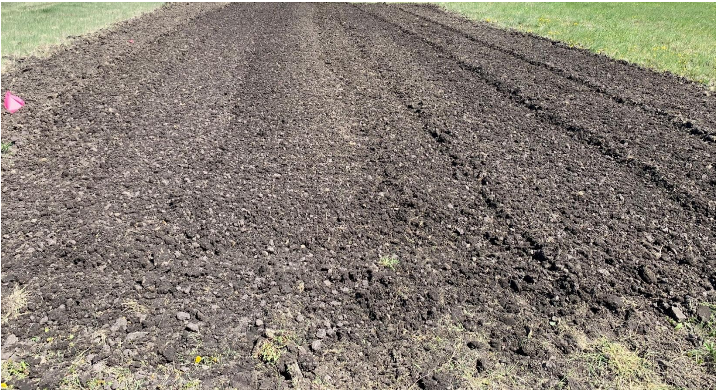
Picture 2. Replication 2 (moderate to high salinity-sodicity) with slightly harder and cloddy seedbed on June 1, 2020.