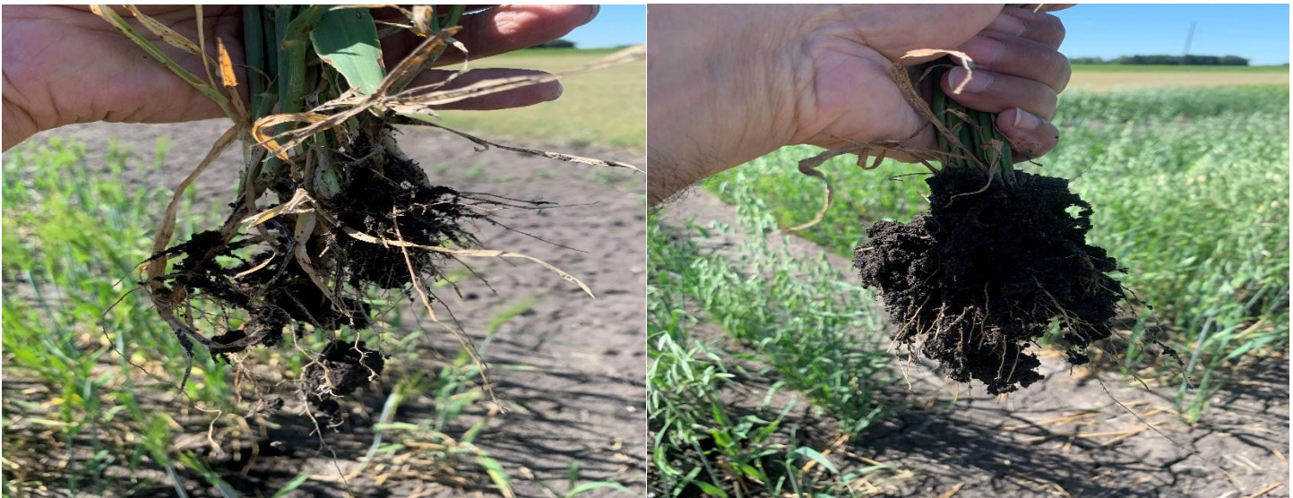
Picture 18 and 19. Barley (left) and oats (right) rooting depths in replication 2 (moderate to high salinity-sodicity) on August 10, 2020.

Replication 1 (low to moderate salinity-sodicity) barley and oat plots also matured about ten to fourteen days earlier than the plots in replication 2 (moderate to high salinity-sodicity) and were harvested on September 15 th . Replication 2 was harvested on September 22 nd while it was still slightly green. Though there was not much to harvest in replication 3 (very high salinity-sodicity) except some oats, which were still not fully mature, plots were combined on September 22 nd , while harvesting replication 2. See pictures 20 to 25 for comparisons.