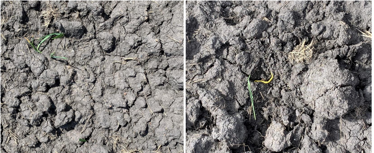
Picture 8 and 9. Some oat seeds started germinating in replication 3 (very high salinity-sodicity) around June 29, 2020.

On July 17 th , average barley plant heights in replication 1 (low to moderate salinity-sodicity) were 21.11 to 27.70 inches with 5 to 100 percent heading completed. Oat plant heights were 22.21 to 25.58 inches with 80 to 90 percent heading completed. In replication 2 (moderate to high salinity-sodicity), barley plant heights ranged between 10.03 to 15.56 inches with no heading initiation. Oat plant heights in replication 2 were 9.12 to 15.27 inches with 5 percent heading completed only in the ND Heart plot. No data was taken from replication 3 (high to very high salinity-sodicity) due to no-barley and very negligible growth of oats. See pictures 10 to 15 for comparisons.