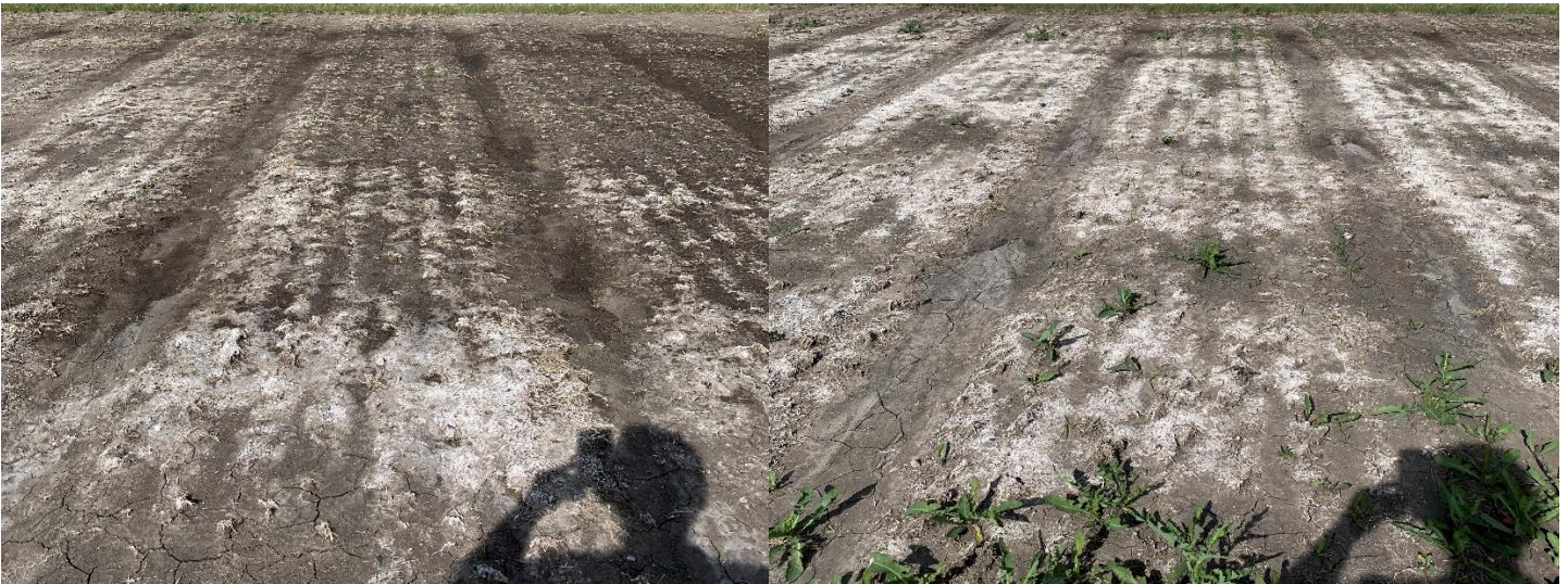
Picture 14 and 15. AAC Synergy Barley (left) and ND Heart Oats (right) growth in replication 3 (high to very high salinity-sodicity) on July 17, 2020.

It was also observed that barley and oat plants adopted to different salinity and sodicity levels by keeping bulk of the roots in the top 6 inches instead of growing into the deeper depths with higher salinity and sodicity levels. That was especially true for replication 1 that had low to moderate levels in the 0-6 inch depth and moderately higher levels in the 6-24 inch depth. However, once surface salinity and sodicity reached high to very high levels in replication 2 and 3 ( EC = 7.80 to 10.50 dS/m and SAR = 18.13 to 27.30 ), germination and growth was poor to negligible. See picture 16 to 19 to compare the rooting depths of barley and oat plants growing in replication 1 and 2. There were no plants in replication 3 to observe rooting depth at that time.