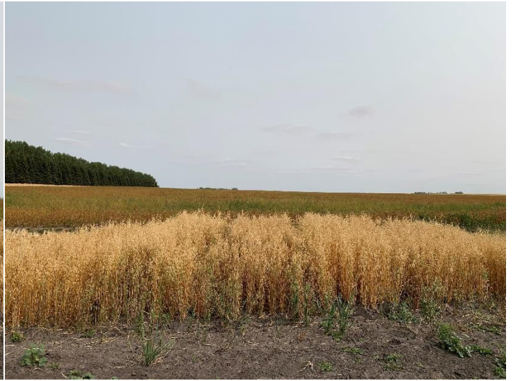
Pictures 20 and 21. Replication 1 (low to moderate salinity-sodicity) barley (left) and oat (right) plots ready to be harvested on September 15, 2020.