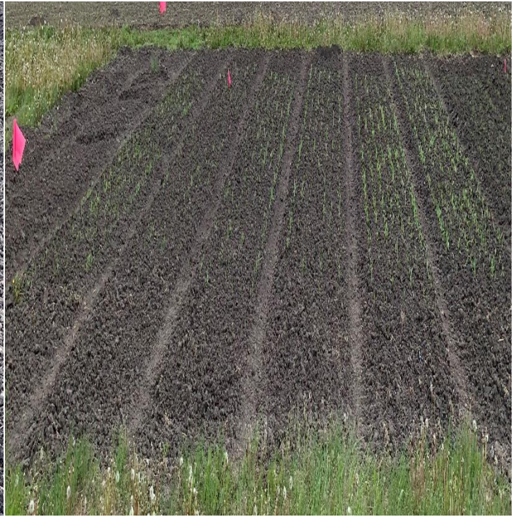
Picture 4 and 5. Germination started in replication 1 (low to moderate salinity-sodicity) around June 8 (left) and completed around June 11, 2020 (right).