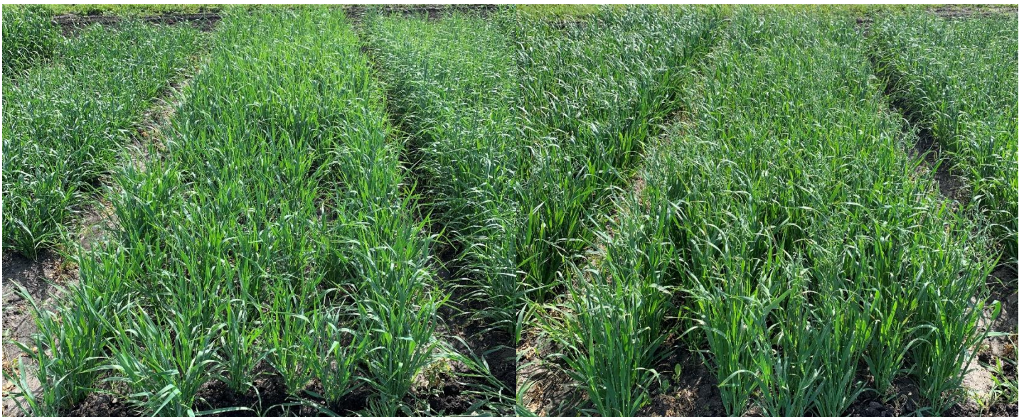
Picture 10 and 11. AAC Synergy Barley (left) and ND Heart Oats (right) growth in replication 1 (low to moderate salinity-sodicity) on July 17, 2020.

On July 17 th , average barley plant heights in replication 1 (low to moderate salinity-sodicity) were 21.11 to 27.70 inches with 5 to 100 percent heading completed. Oat plant heights were 22.21 to 25.58 inches with 80 to 90 percent heading completed. In replication 2 (moderate to high salinity-sodicity), barley plant heights ranged between 10.03 to 15.56 inches with no heading initiation. Oat plant heights in replication 2 were 9.12 to 15.27 inches with 5 percent heading completed only in the ND Heart plot. No data was taken from replication 3 (high to very high salinity-sodicity) due to no-barley and very negligible growth of oats. See pictures 10 to 15 for comparisons.