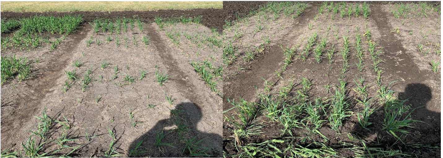
Picture 12 and 13. AAC Synergy Barley (left) and ND Heart Oats (right) growth in replication 2 (moderate to high salinity-sodicity) on July 17, 2020.