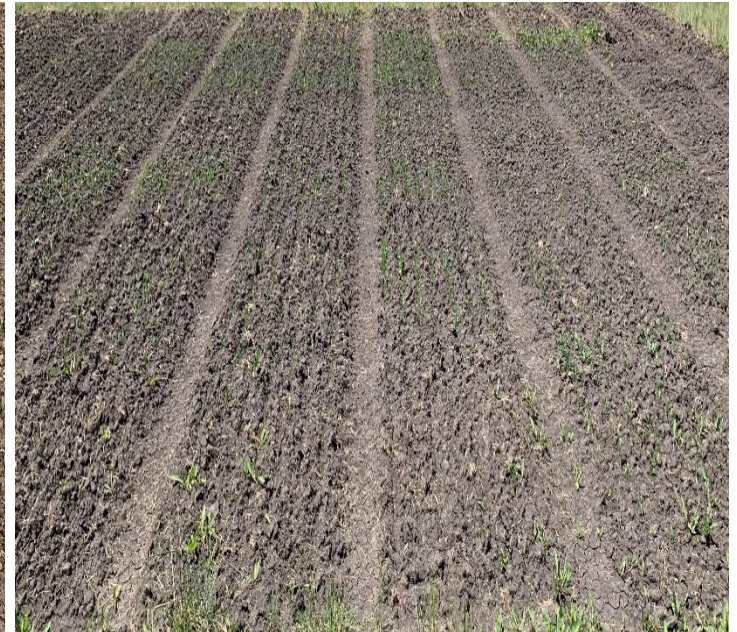
Picture 6 and 7. Germination started in replication 2 (moderate to high salinity-sodicity) around June 16 (left) and completed around June 23, 2020 (right).