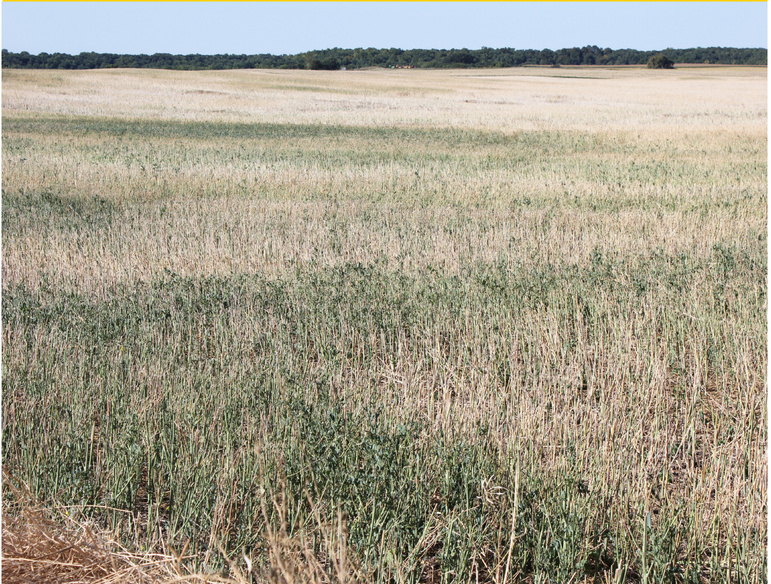
Figure 6. Plant residues ready to be incorporated into the soil.