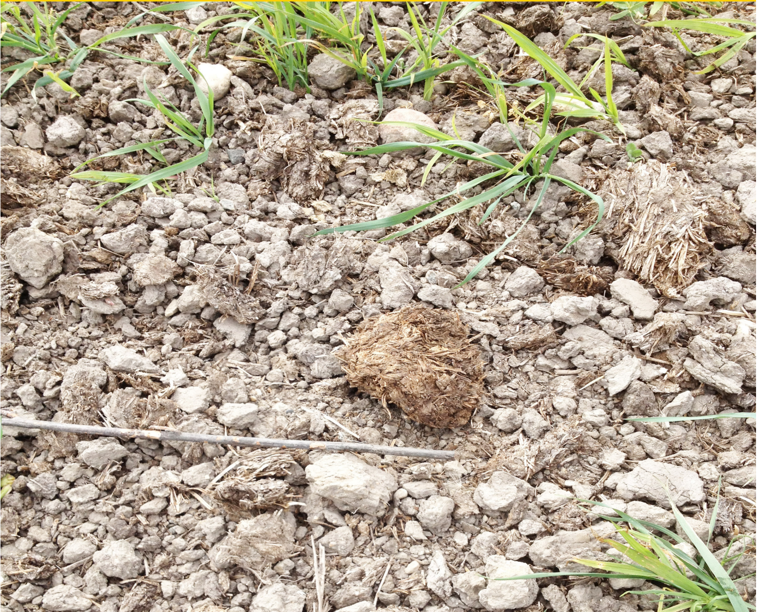
Figure 1. Recently applied livestock manure to improve soil organic matter level.

Soil organic matter is a very important part of the composition of a healthy soil. It is the decomposition product of different types of organic materials. Materials that go through the decomposition process to form soil organic matter include: crop and plant residues, tree litter, animal waste, animals and different types of soil organisms, their by-products and to a lesser extent human waste (figure 1).