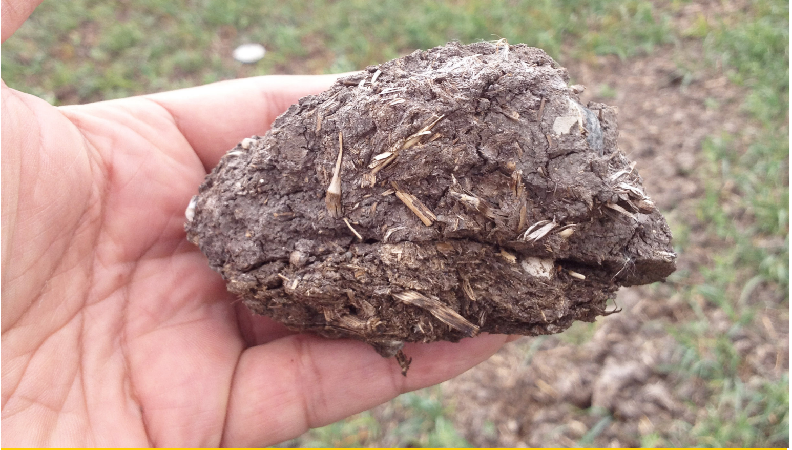
Figure 3. Recently added organic material going through the decomposition process.

Soil organic matter is heterogeneous or non-uniform in nature and does not have any defined physical or chemical structure. It can be present in soils under various stages of decomposition (figure 3) from mineral associated partially decomposed plant material to fully decomposed humus (Sylvia et al., 2005).