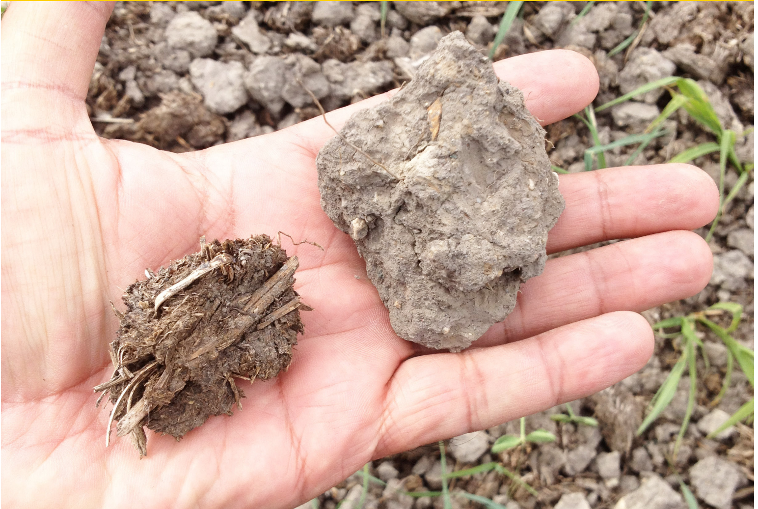
Figure 5. A recently added aggregate of livestock manure (left) versus a heavy soil aggregate of poor structure on the right.

Though small in proportion to the entire soil mass by weight, organic matter is linked to important functions in the soils directly or indirectly and is critical to maximizing biological activity within the soil (figure 5). Humic materials (humus) along with clay particles provide cation exchange sites in soils that hold the positively charged plant nutrients improving the soils ability to reduce nutrient losses to leaching. Although the relative proportion of the soil organic matter fraction is small compared to the clay fraction on a dry weight basis, humus provides a greater number of exchange sites, many times greater than the clay portion of the soils. Microorganism supported by the rich food substrate of soil organic matter stabilize soil particles through encouragement of aggregation, which results in better water holding capacity in sandy soils and improved soil drainage in clay soils by promoting larger sized pores.