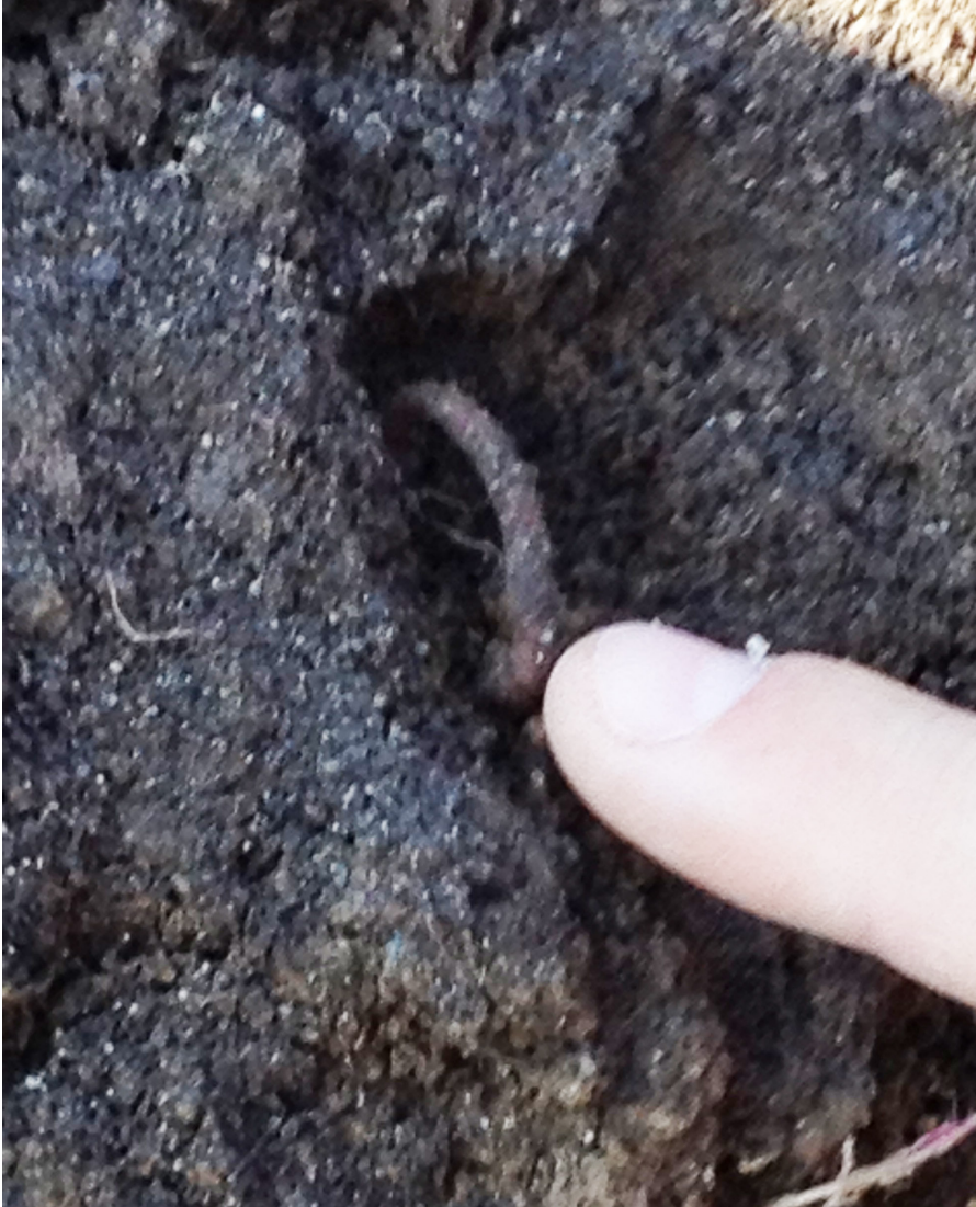
Figure 4. An earthworm actively functioning in the soil.

A wide range of soil organisms exist and what they consume varies. Some feed only on plants, other living organisms or both, and some known as detritivores eat dead and decaying plant or animal matter that may include excrements. Each group of organisms plays a different role. Larger soil organisms such as earthworms, mites and beetles (figure 4) shred organic material creating greater surface area and reduce the size of organic material which in turn provides access to soil microorganisms that play a primary role in the decomposition of organic materials and the formation of soil organic matter (Fortuna, 2012).