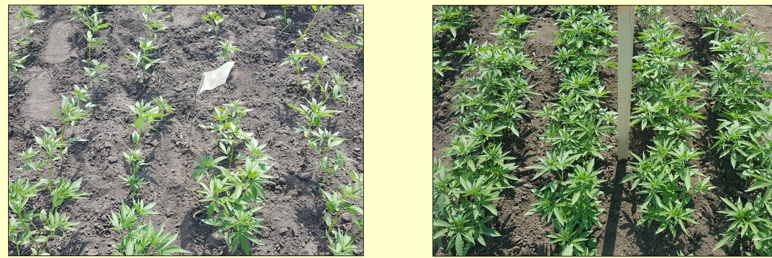
Fig. 2. Plant density 26 plants/m 2 (left photo); and 130 plants/m 2 (right photo); photos taken 21 days after planting