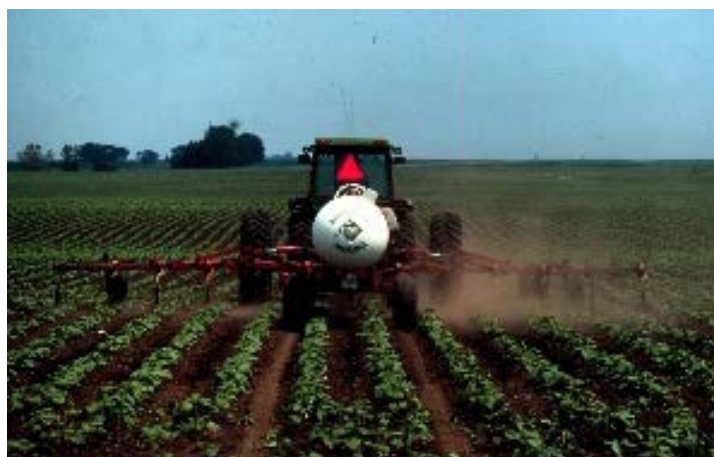
Figure 1. Side-dressing ammonia on sunflowers about V8.

There are differences in the response of sunflower in eastern North Dakota compared to those in western North Dakota ( Figure 2 ). In addition, the Langdon region is separated from the rest of eastern North Dakota due to the small shale pieces the soil in this region contains. These shale pieces are the source of mineralizable, plant-available ammonium, causing these soils to act as a natural slow-release N fertilizer. The N recommended in the Langdon Region is less than in the rest of the eastern region.