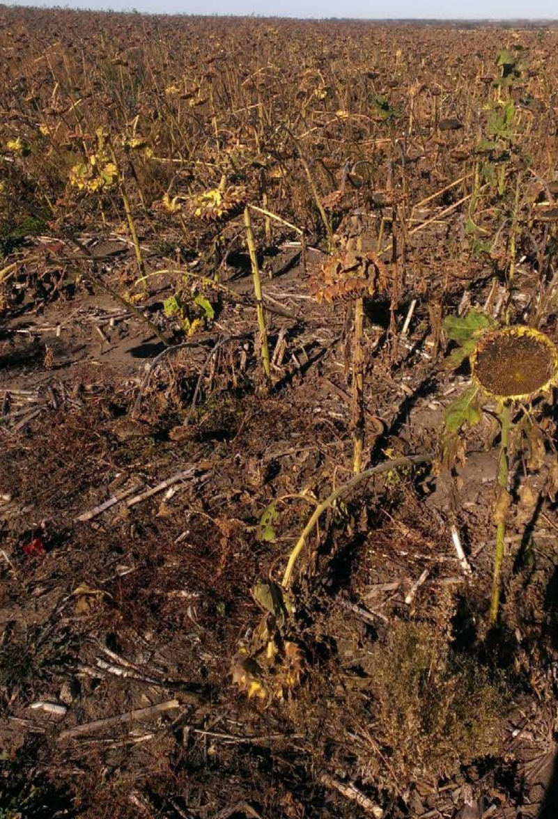
Sunflowers near harvest with significant lodging due to strong winds in a July thunderstorm.