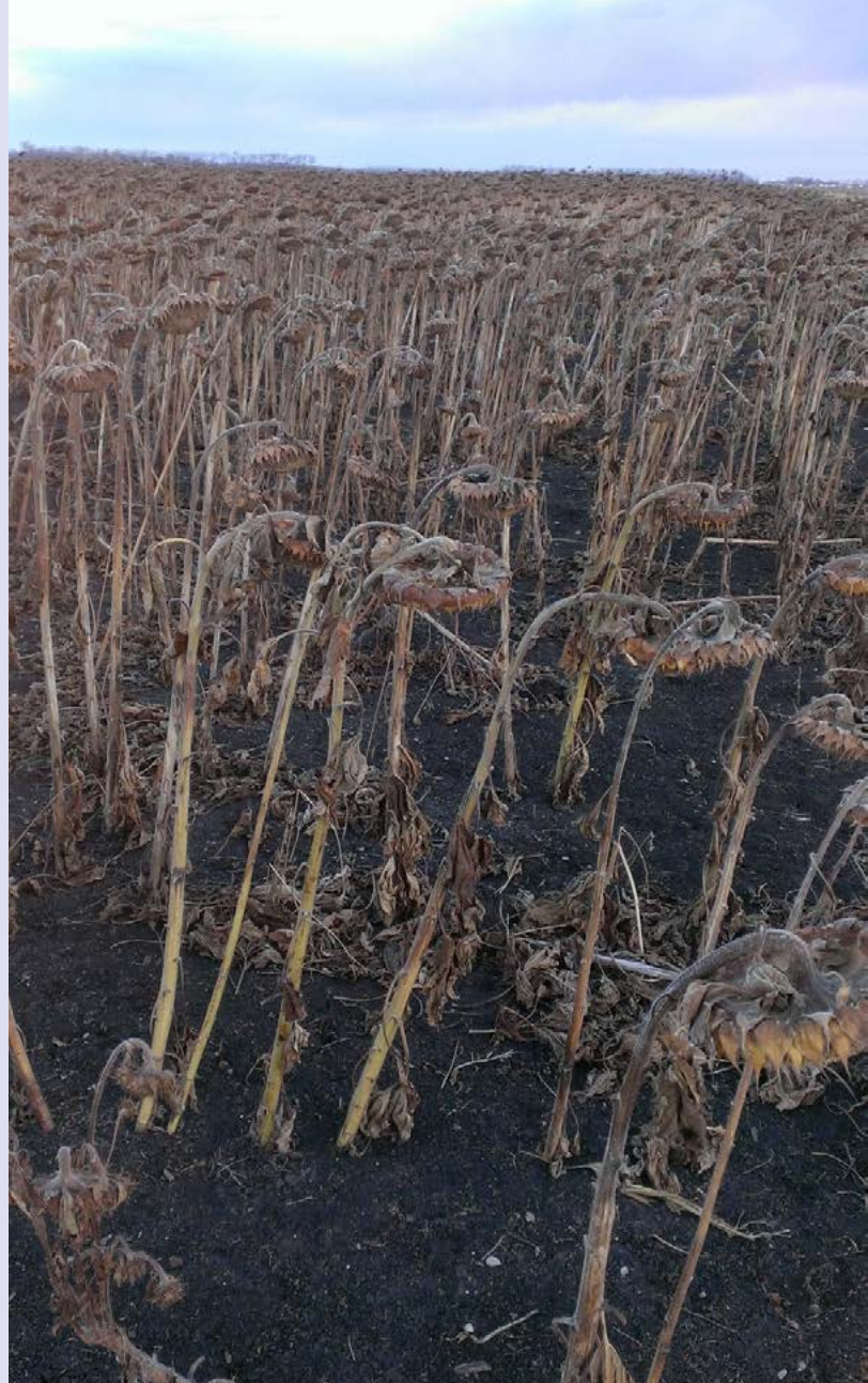
Sunflowers ready to harvest near Bottineau, N.D., 2015.