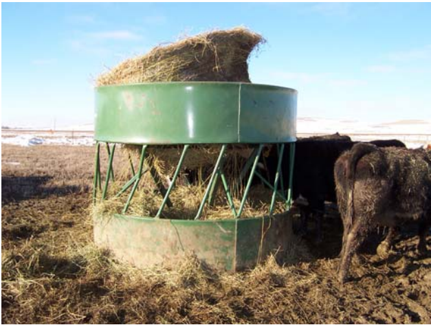
Figure 6. Poorly tied, loose oat-hay bale.