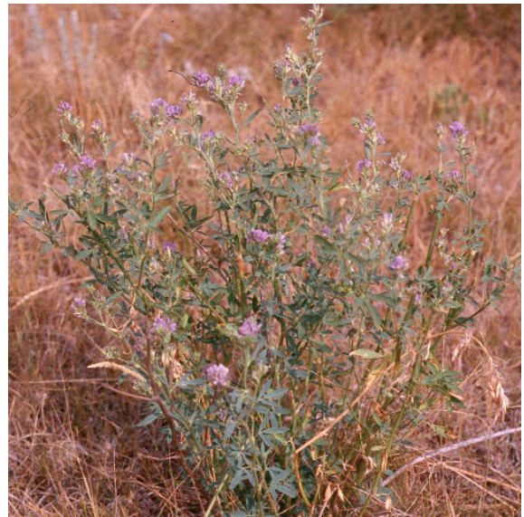
Fig. 10. Interseeded mature alfalfa plant.