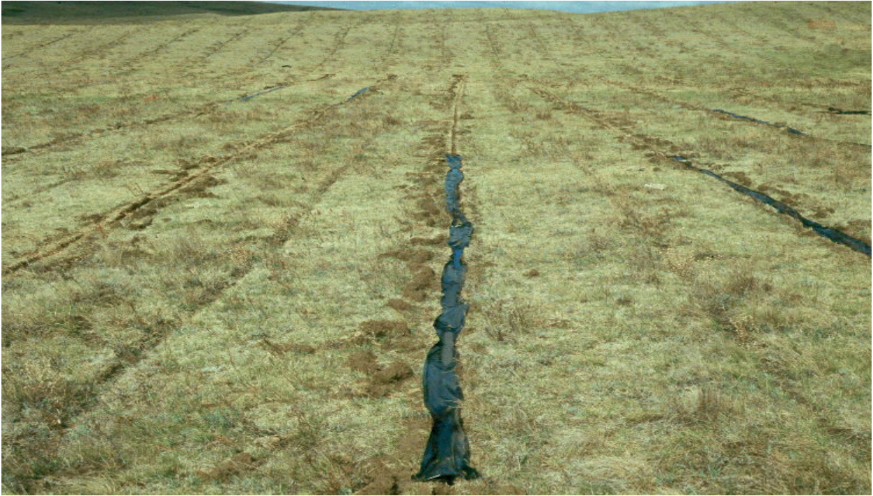
Fig. 13. Black plastic furrow mulch.