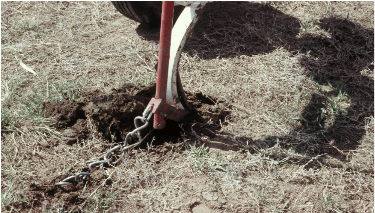
Fig. 12. Seedbed firmed with drag chain.