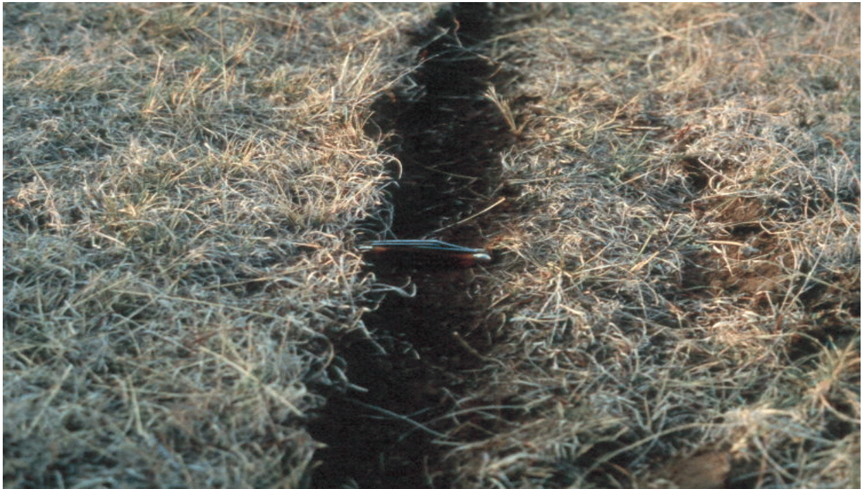
Fig. 6. Furrow made with four-inch twisted chisel plow shovel.