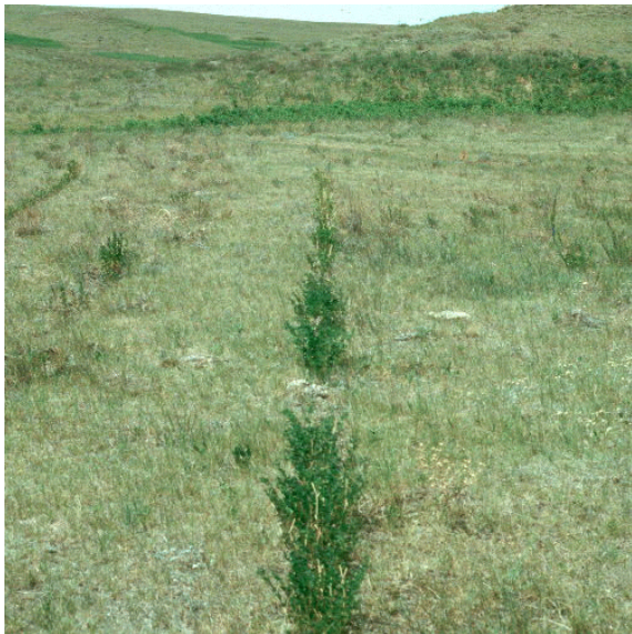
Fig. 9. Interseeded furrow, year three.