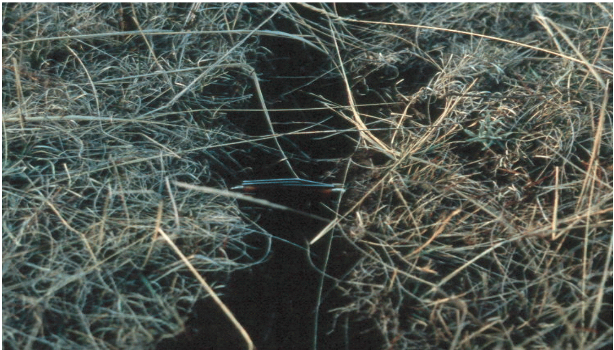
Fig. 4. Furrow made with three-inch twisted chisel plow shovel.