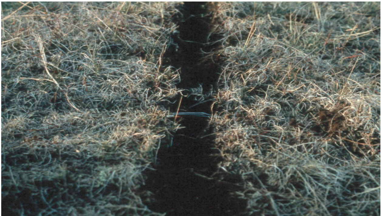
Fig. 2. Furrow made with two-inch straight spike chisel.