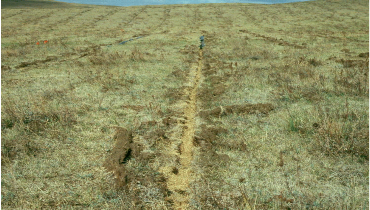
Fig. 15. Chopped crested wheatgrass hay furrow mulch.