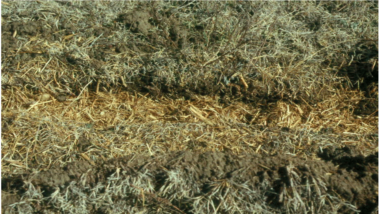
Fig. 18. Furrow mulched with chopped straw.