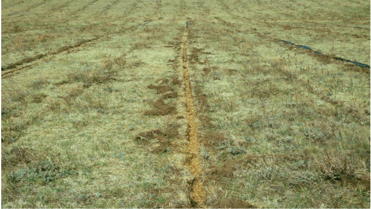
Fig. 17. Chopped oat straw furrow mulch.