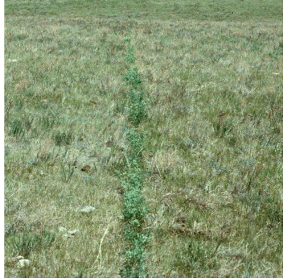
Fig. 8. Interseeded furrow, year two.