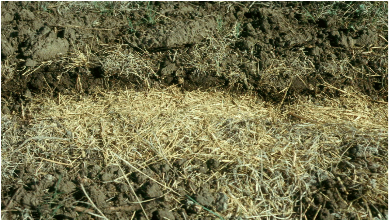
Fig. 16. Furrow mulched with chopped hay.