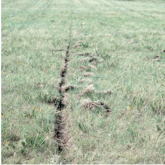
Fig. 7. Interseeded furrow, year one.