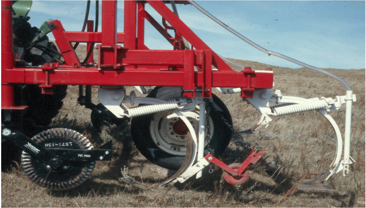
Fig. 11. Seedbed firmed with pack wheel.