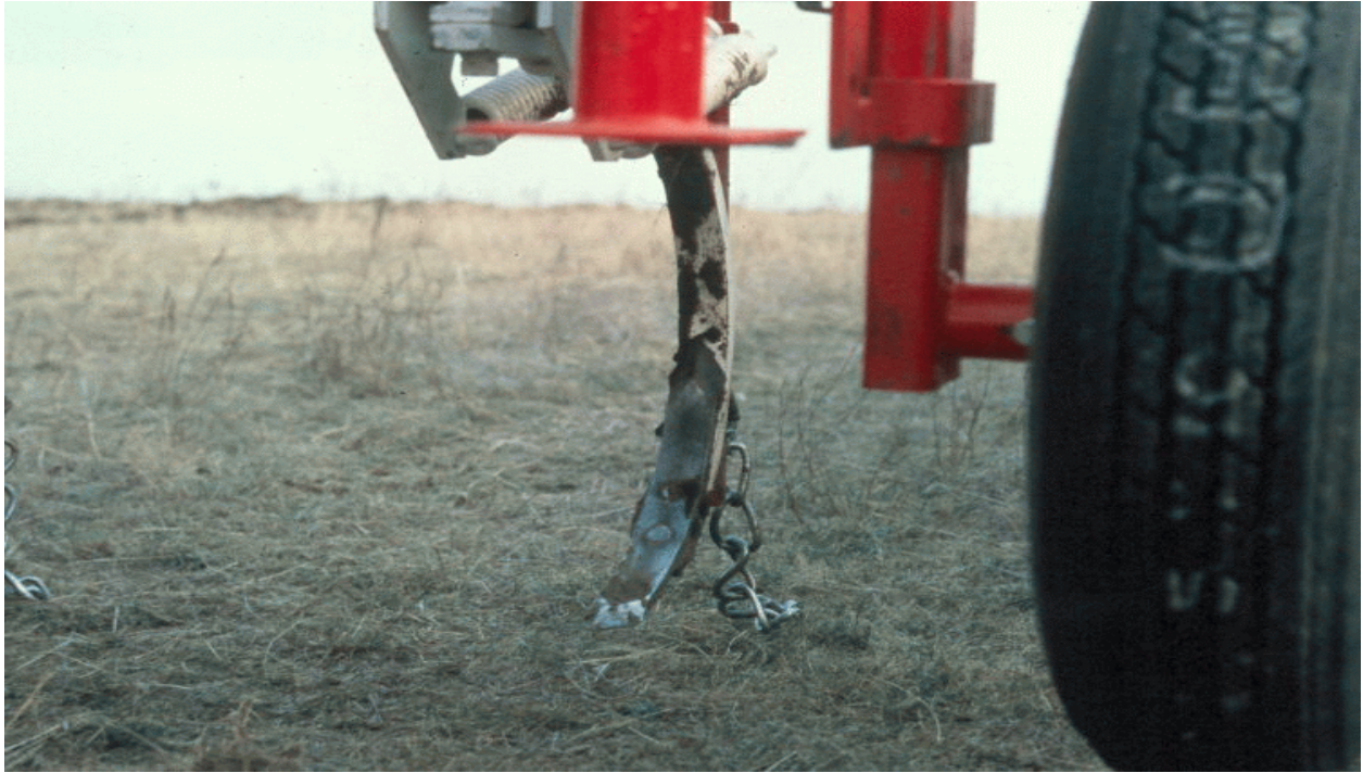
Fig. 1. Two-inch straight spike chisel.