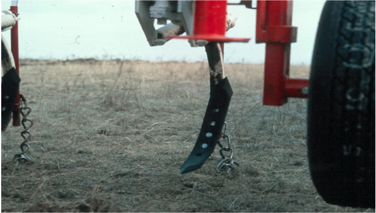
Fig. 3. Three-inch twisted chisel plow shovel.