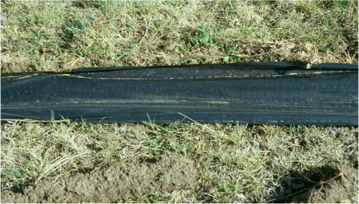
Fig. 14. Furrow mulched with black plastic.