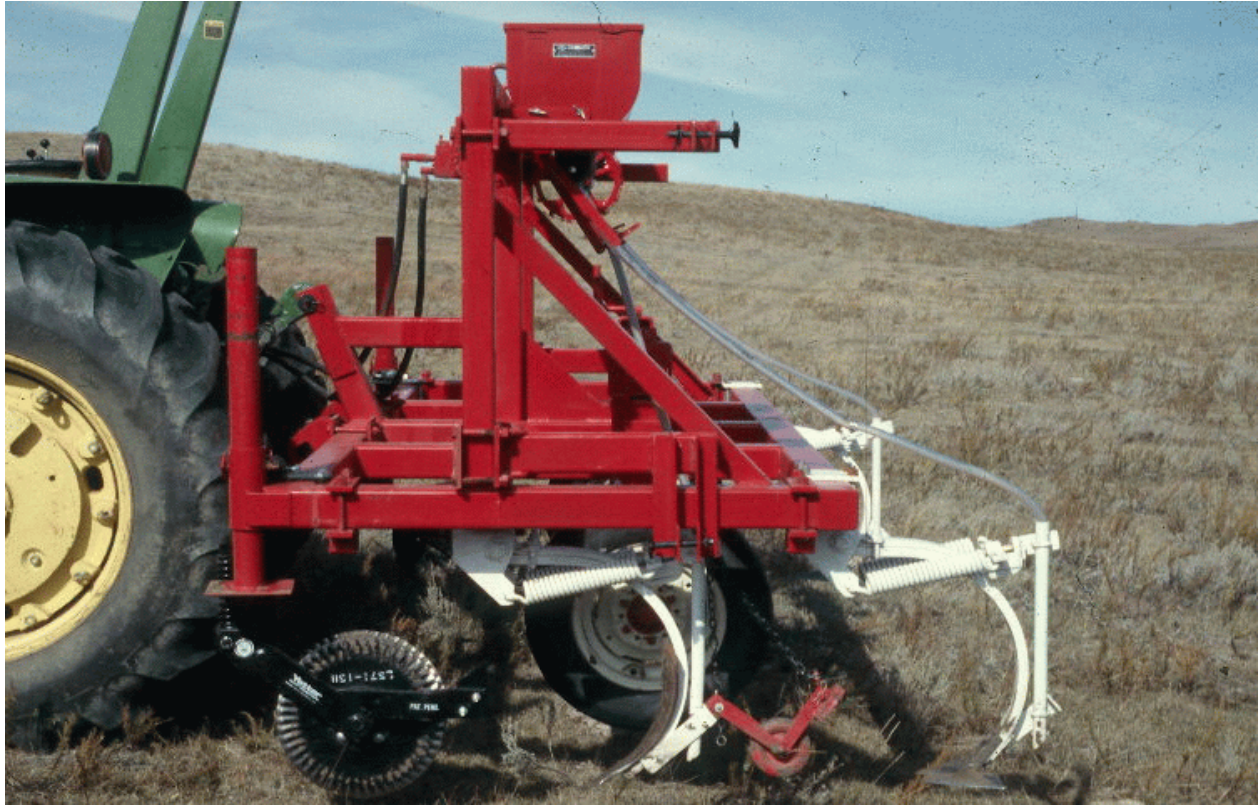
Fig. 19. Modified three toolbar interseeding machine. The front toolbar carries the double straight coulters placed side by side and three inches apart. The middle toolbar carries the three-inch twisted chisel plow shovel, the seed tube, and the pack wheel. The back toolbar carries the 12-inch cultivator sweep with the tip removed and the fertilizer tube.