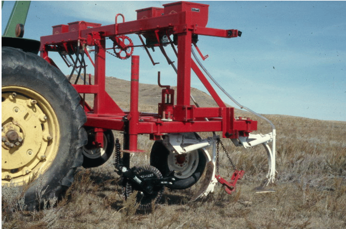
Fig. 1. Triple-toolbar interseeding machine.