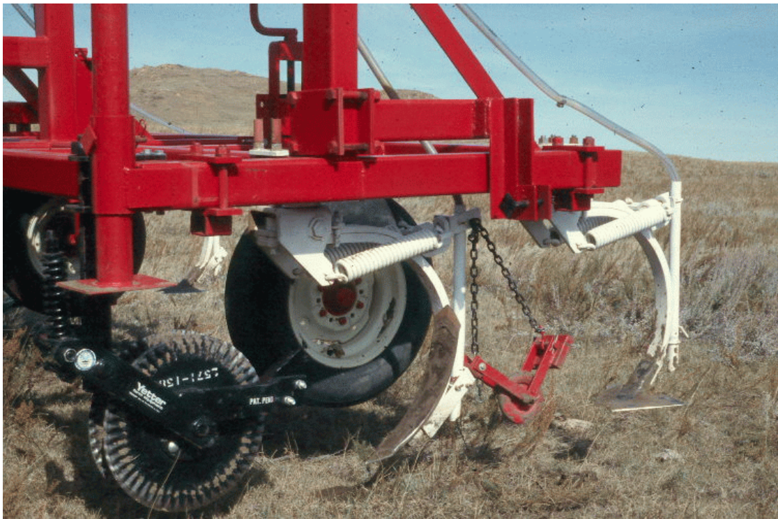
Fig. 2. Interseeding tools: double straight coulters, 3-inch twisted chisel plow shovel, and 12-inch cultivator sweep with tip removed.