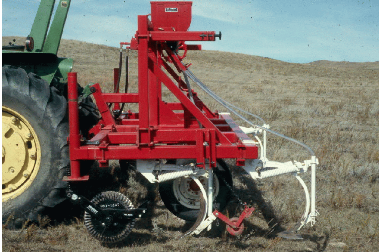
Triple-toolbar interseeding machine with double straight coulters, three-inch twisted chisel plow shovel, and twelve-inch cultivator sweep with tip removed.