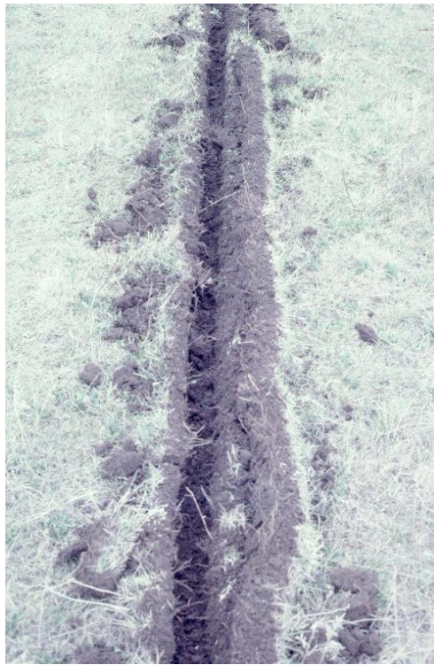
Fig. 4. Three-inch clean furrow row produced by triple-toolbar interseeding machine.