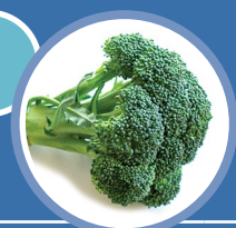
Table 2. Examples of Food Sources of Folate and Folic Acid.

Surprisingly, folic acid added to foods and vitamin pills is easier for the body to use than the folate naturally occurring in foods.