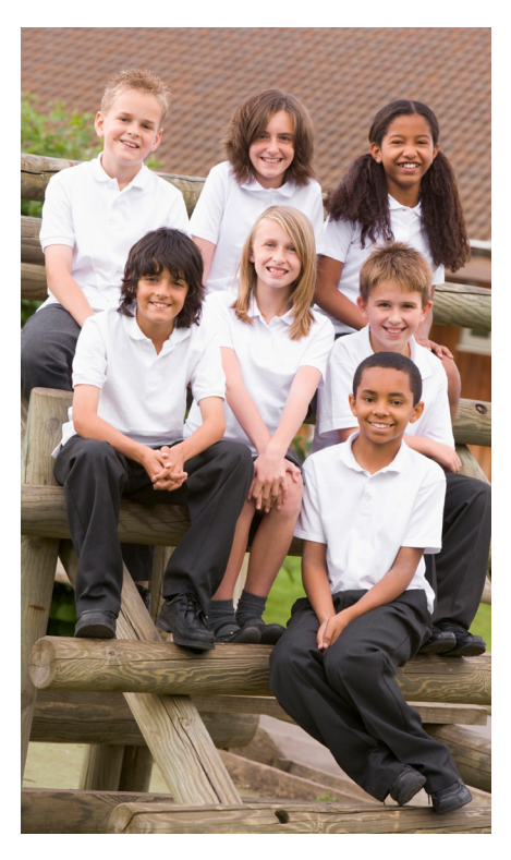
Family and community values help parents decide what is acceptable.