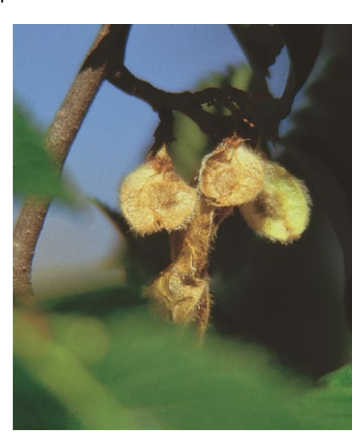
Credits: Tree Selector Website, http://www.missouribotanicalgarden.org/PlantFinder/PlantFinderDetails.aspx?kempercode=a922