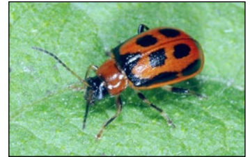
Figure 15. Adult - red bean leaf beetle