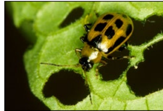
Figure 14. Adult - yellow bean leaf beetle

Adult (Figures 14 and 15): About ¼ inch long, oval-shaped, greenish-yellow to reddish-brown beetle, with four black spots on wings (spots also can be absent) and black margin near wing edges. Beetle always has a black triangular mark in middle and behind prothorax. Adults feed on foliage causing small, round holes between leaflet veins and on pods ( Figure 16 ).