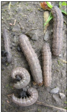
Figure 12. Larva - dingy cutworm larva

Adult (Figure 13): Dark gray, brown or dull yellow or tan moths with dark wing markings, robust body, wingspan length of 1¼ to 1½ inches.