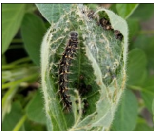
Figure 3. Thistle caterpillar in webbed nest

Adult (Figure 4): Wing span of 2½ to 3½ inches. Forewings red-orange and brown with black and white spots. Hindwings orange-brown with four black "eye spots" along edge. Feeds on flower nectar and aphid honeydew. Migrates into North Dakota each spring.