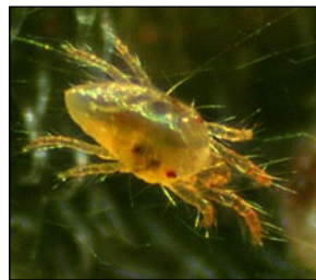
Figure 7. Two-spotted spider mite

Adult (Figure 7): Small, less than 0.02 inch (magnification is needed to see them in detail), green, yellow or orange body, two dark spots on the abdomen for two-spotted spider mite, eight legs. Located on the undersides of leaves. Produce spiderlike webbing (Figure 8) and stippling injury on leaves (Figure 9).