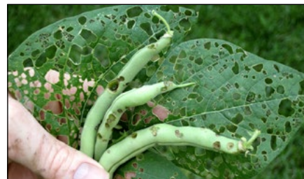
Figure 16. Bean leaf beetle defoliation and pod damage