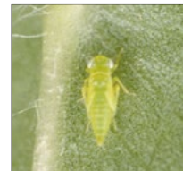
Figure 17. Nymph - potato leafhopper

Both nymphs and adults feed on plant juices.