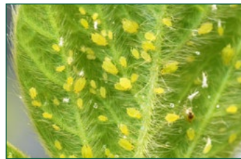
Figure 5. Soybean aphid nymphs and adults on underside of leaf

Both nymphs and adults feed on plant juices.