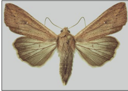
Figure 11. Adult - armyworm