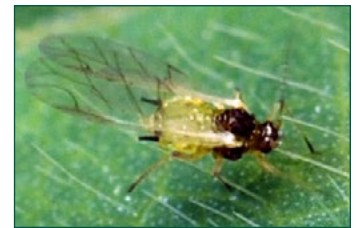
Figure 6. Adult - soybean aphid