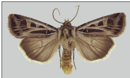
Figure 13. Adult - dingy cutworm