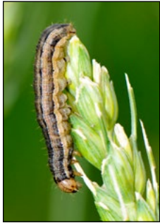
Figure 10. Larva - armyworm (P. Beauzay, NDSU)

Adult (Figure 11): Light brown moth with a conspicuous white spot about the size of a pinhead on each front wing, wingspan of 1½ inches.