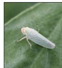
Figure 18. Adult - potato leafhopper