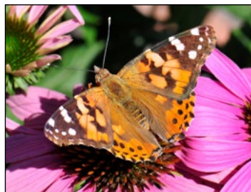
Figure 4. Painted lady butterfly