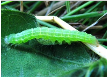
Figure 1. Larva - green cloverworm

Adult (Figure 2): Wingspan of 1 inch. Dark brown moth with spots. When moth rests, wings form a triangle. Migrates into North Dakota each spring.