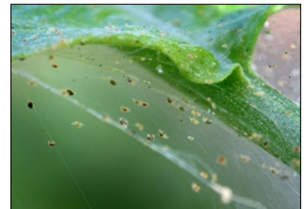
Figure 8. Webbing from two-spotted spider mites