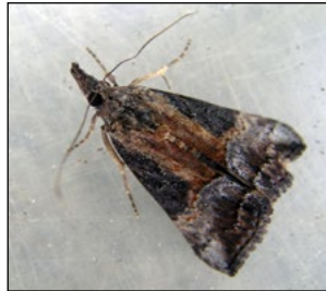
Figure 2. Green cloverworm moth (J. Gavloski, Manitoba Agriculture, Food and Rural Initiatives)