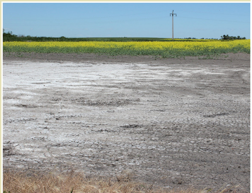
Figure 1. A salt-affected unproductive area next to productive land with canola in Walsh County, N.D.

A soil can be mapped as very fertile; however, it may not be productive due to high salinity and/or sodicity. Soils with high salinity and sodicity usually have adequate levels of essential plant nutrients because the nutrients are not being removed due to poor or no plant growth and low grain/fodder production, compared with more productive areas of the field.