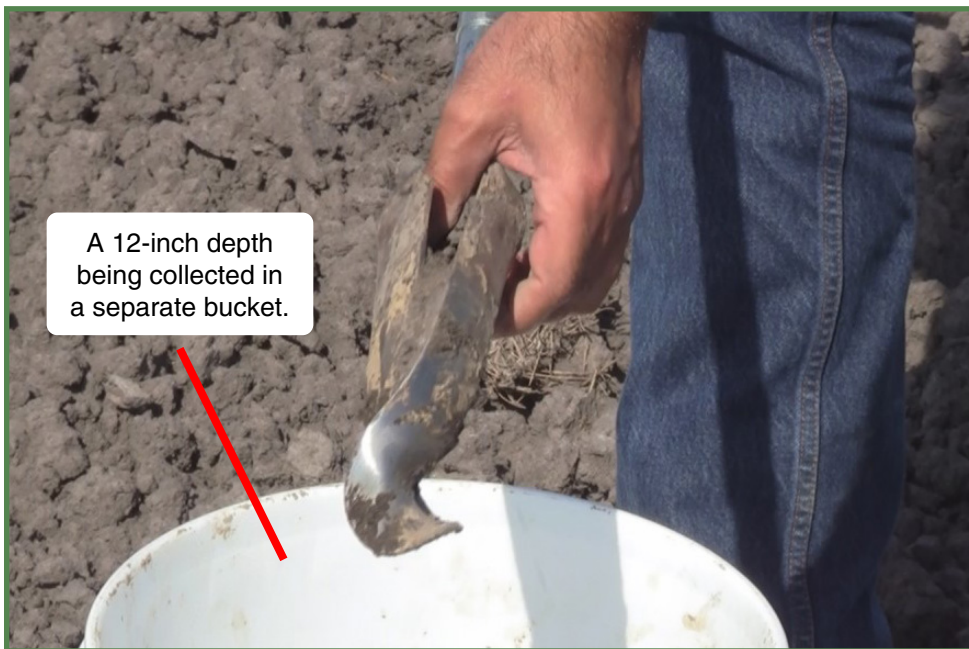
Figure 5. Soil depth is being separated in 12-inch increments.

For tiling, the sampling depth should match the deepest depth of the tiles (generally not more than 4-feet) in 12-inch increments. For detailed information, refer to the NDSU Extension publication SF1617, "Evaluation of Soils for Suitability for Tile Drainage Performance" (Revised July 2020). www.ag.ndsu.edu/publications/crops/evaluation-of-soils-for-suitability-for-tile-drainage-performance