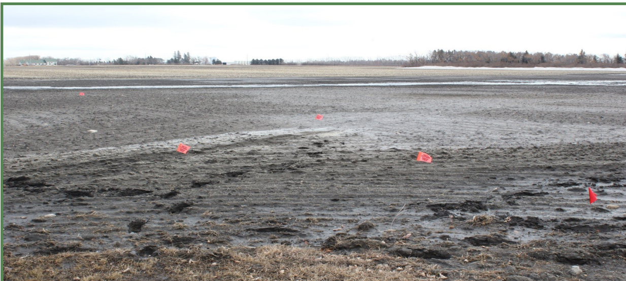
Figure 2. This field near Langdon, N.D., has a saline-sodic area with no clear visual symptom of sodicity at the soil surface.

Sampling in zones will provide soil test results specific to each zone, which will contribute to the strategy needed to address the reclamation of the soils within each zone.