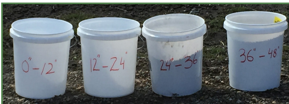
Figure 6. A 4-foot-deep sample is being separated in 12-inch increments.