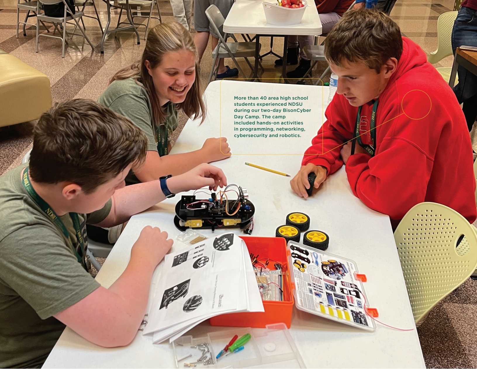
More than 40 area high school students experienced NDSU during our two-day BisonCyber Day Camp. The camp included hands-on activities in programming, networking, cybersecurity and robotics.