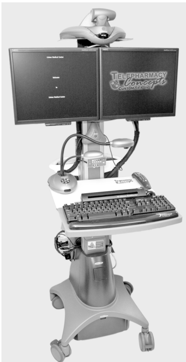
Figure 2. Mobile telepharmacy cart with dual LCD monitors.

In order to establish and implement telepharmacy services between the CHI COE site and remote rural hospital sites, several contractual agreements needed to be developed and signed by all participating parties. These