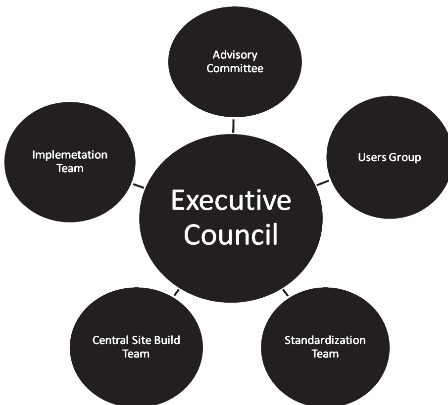
Figure 3. Catholic Health Initiatives governance structure for the hospital telepharmacy program.

For the first software component, a documentation form was adapted from a paper ADE audit form used by